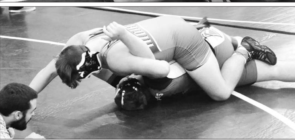
King of the Mountain wrestling photos by Lowell Nicholson