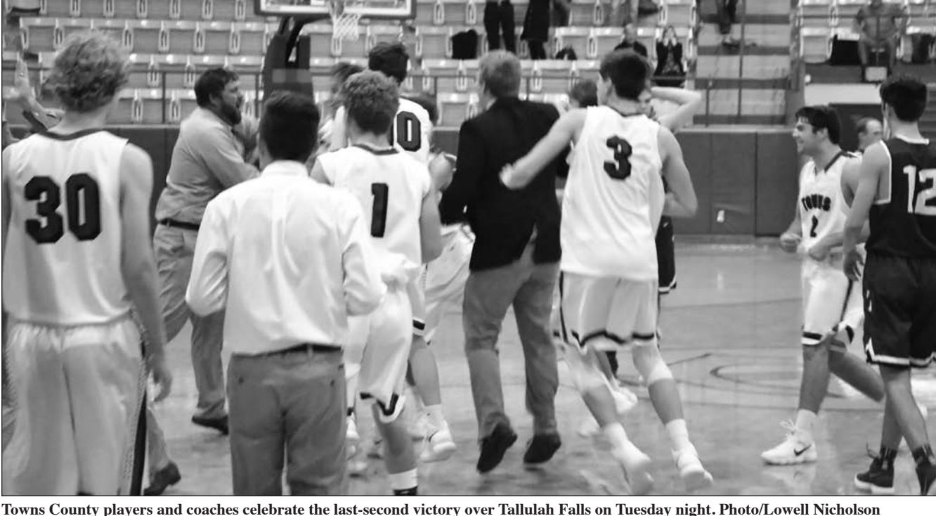
Towns County players and coaches celebrate the last-second victory over Tallulah Falls on Tuesday night.